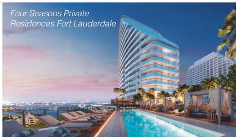
Four Seasons Private Residences Fort Lauderdale

RESIDENCES: 1-5 bedrooms; 1,400-5,000 sq. ft. PRICE: $1.8 million to $9.8 million SCHEDULED COMPLETION: Phase 1, late 2017; Phase 2, mid-2018